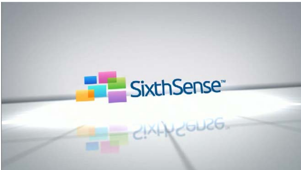
Motion Graphics advertisement created for SixthSense using Adobe After Effects May 2014